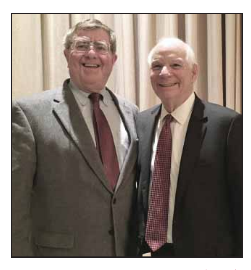
Roy Littlefield with Senator Ben Cardin (MD-D).

We will continue to build strong relations with the delegation and involve them in our future government affairs efforts.